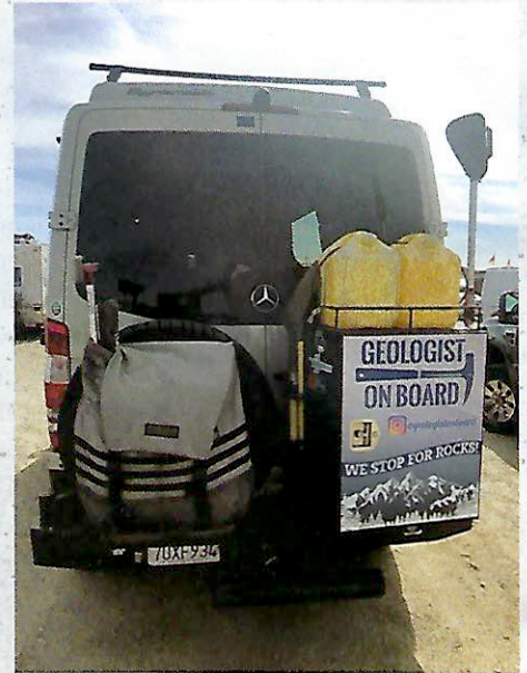
Now this vehicle has a perfect message. The owner is the woman behind the popular Instagram account @geologistonboard.